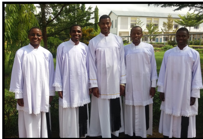
2nd year Theology acolytes at Kipalapala Seminary