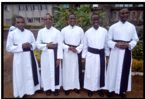
Cassock Day at Kibosho Seminary when 1st Year Philosophy students receive their cassocks

My message to our readers is that God has the purpose with everyone. In a special way for those who hear deep inside their hearts to be called as priests. It is through your missionary supports and encouragement they can be able to adhere to such a call through studies in the major seminaries. When you support or sponsor one seminarian you have done a very great job of helping him to have enough concentration in his studies towards priestly journey. Moreover, the assurance comes when such a seminarian becomes a priest and does well God's apostolate of serving Him and His people.