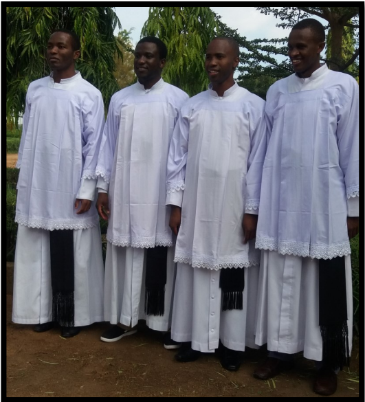
3rd year Theology acolytes at Kipalapala Seminary